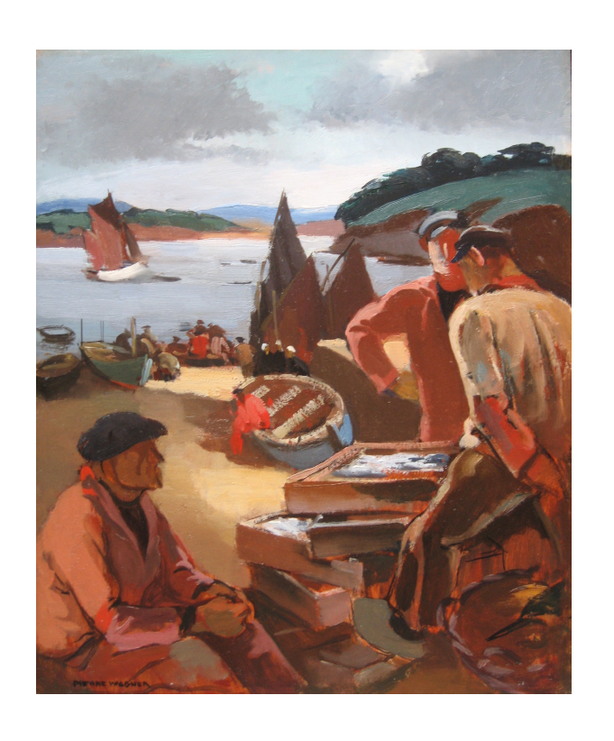
M.S Rau Antiques Booth #1700/1801

Pierre Wagner (1897-1943) Sailors in Brittany Oil on Board, 15 x 18 inches